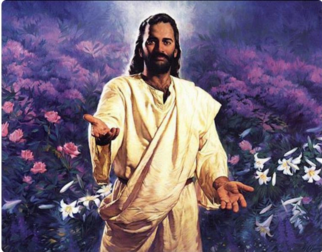
In a little while we're going home.